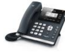
Yealink T4 series