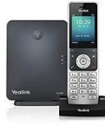
Yealink DECT Cordless