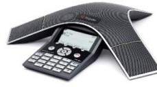
Polycom SoundStation Conference Phones