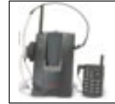
10U100 Complete Solution #407 875 939