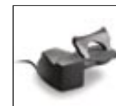
Avaya HL10 Telephone Headset Lifter Accessory #408 346 146