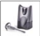
AWH-54 Wireless Headset #700 373 301