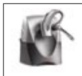
New ABT-34 Bluetooth Headset System #700 382 468