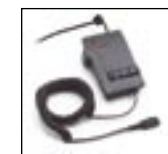
M12LUCM Amplifier #407 639 715