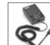
PARTNER/Analog Amplifier #407 153 253